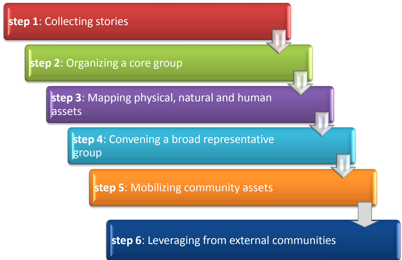
Figure 2: Conceptual framework of the steps of ABCD process as defined by McKnight and Kretzmann

The ABCD process could be conceptualized as a strategy for sustainable community driven development. Beyond the identification and mobilization of particular community assets, ABCD approach is mattered of linking micro community assets, either physical or human resources, to the macro external environment. In other words, a great amount of effort is done to destruct the non tangible insulator wall around local communities. And more attention is paid towards the community position in relation to local institutions and the external economic environment (Pan et al, 2005).