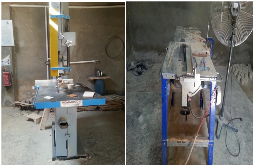
Figure 4: Examples to the simplified devices that are used at Al-Kayat village

After meeting the requirements, a training program is given to the villagers to familiarize them with the process, instructions and the instruments. Ultimately, the project progresses to large scale production. In certain projects, female villagers played a successful role in actuating the project and controlling the turnover problem. In Shammas project, females were preparing the Jam at their homes, and it is expected that females will also play a major role in Al-Kayat project either.