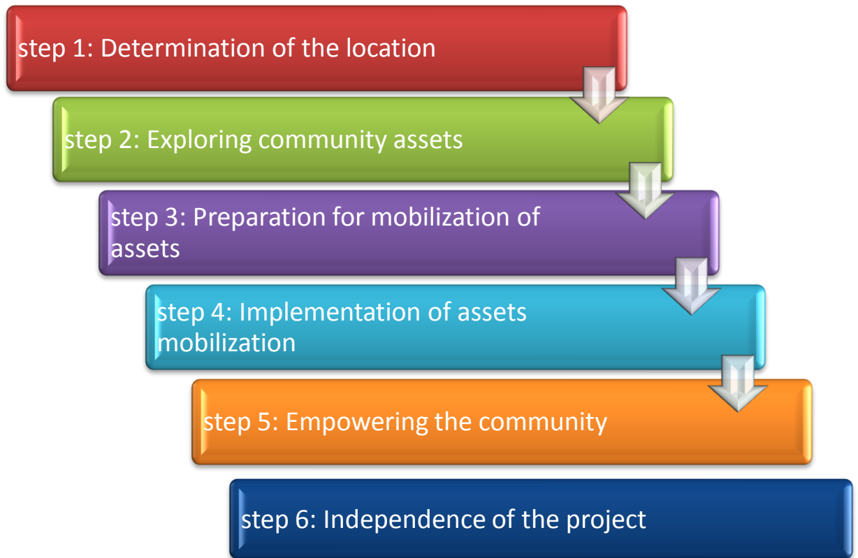
Figure 3: Conceptual framework to the steps of the Egyptian approach to development in rural communities of Egypt